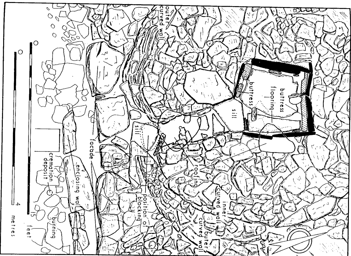
FIG. 5. Tulaich an I-Sionnach : plan of passage and chamber

The W. side of the heel-shaped cairn was disturbed and robbed, so that very little survived and the exact position of the side wall could not be identified. Assuming that the heel-shaped cairn was symmetrically planned, comparison with the position of the E. wall in relation to the passage and diameter of the circular revetment wall,