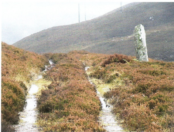
NH 836257 (to SE)