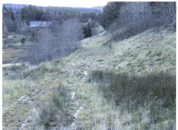
NH 797309 (to S)