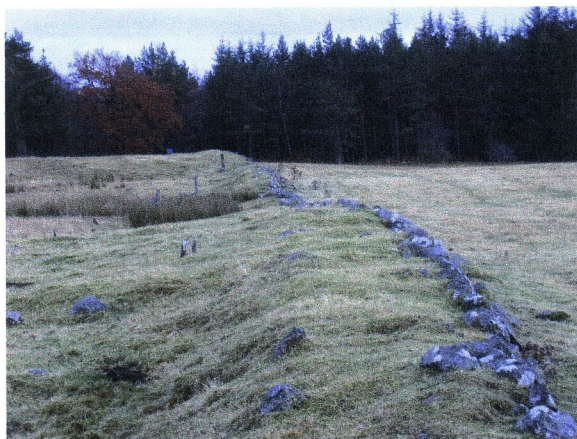
NH 798299 (to SE)