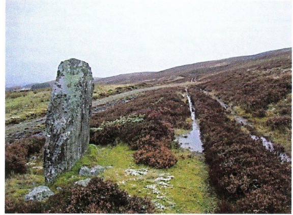
NH836257 (to NW)