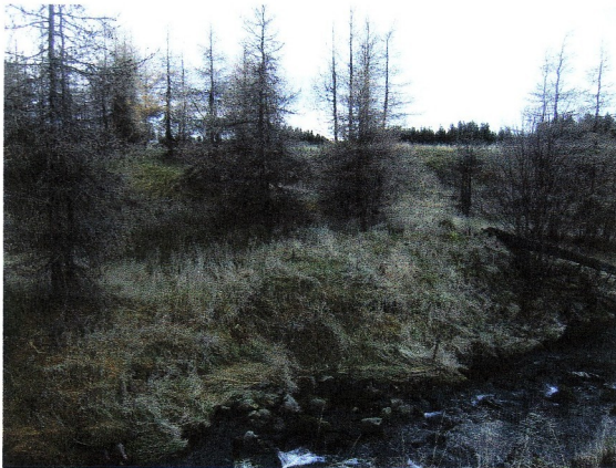
NH 796300 (to NW)