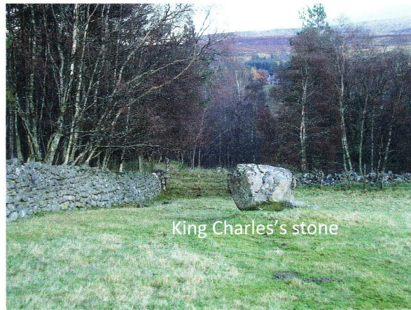
NH 808294 (to E)