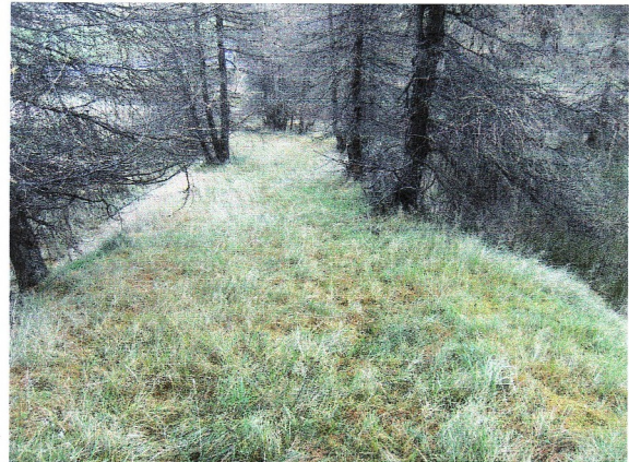
NH 796301 (to SE)