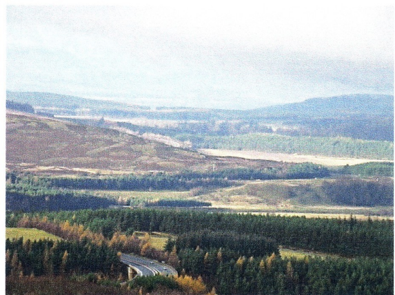
View towards Moy