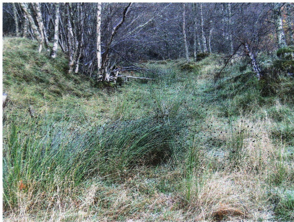
NH 809293 (to E)