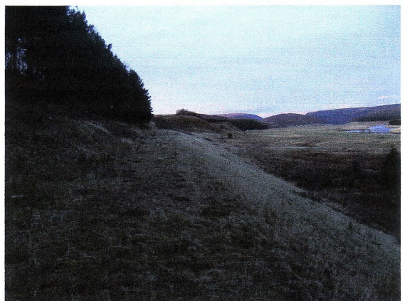
NH 797309 (to N)