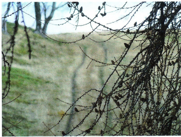
NH 800295 (to ESE)