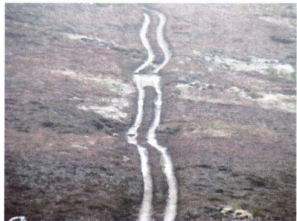
NH 828268 (to NW)