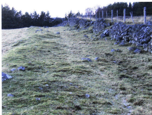
NH 808294 (to W)