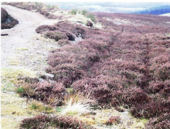
NH 823 275 (to NW)