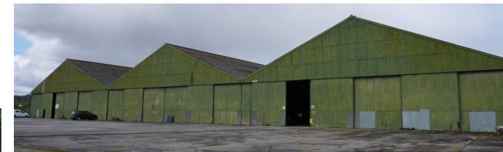
7. The hangars around the Deephaven entrance preserve one of the best clusters of wartime hangars on military airfields. Two were demolished recently. The nearby houses were married quarters during the war.

Please note that many buildings are still in use, while others are unsafe. Please respect private property and do not enter buildings