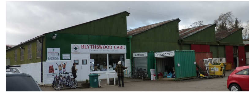
3. RAF and Navy Workshops in Blytheswood compound. The Blytheswood charity shop is the only publicly accessible wartime building. The high north facing windows allowed even lighting.