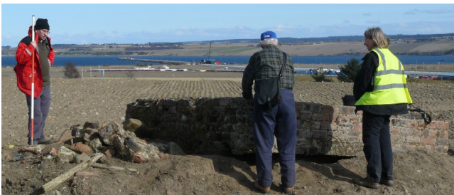
9. The remains of what was probably battle headquarters survive in a field visible from the old and new A9.