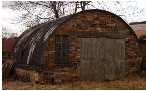
2. Off Beechwood Road are several wartime buildings including this wartime first aid station, a large hangar used now by Munros, and two large Romney huts.