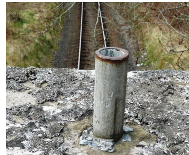
Gun mount on Newton Road North railway bridge

If you have any information to add, please contact the ARCH office at info@archhighland.org.uk or 01349 868230.