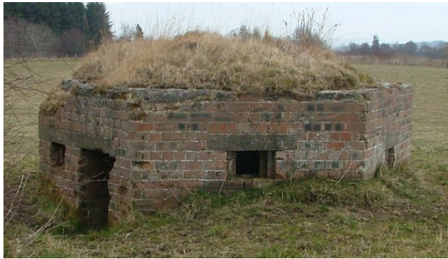
10. At the southern edge of the village, the old wireless station is preserved, along with its pill-box. Originally there were 5 masts on this site.