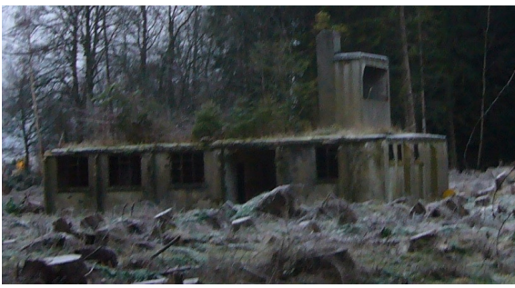
1. This abluitions block (wash house) near the Evanton Road recently emerged after tree felling. The surrounding nissen hut barracks are long gone.