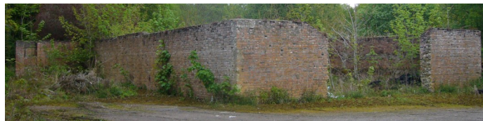
8. At the end of Newton Road north beside the A9 are the remains of a large coal store.