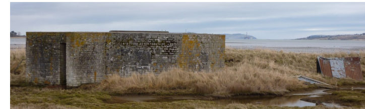
5. This type 27 pillbox is one of three pillboxes still in situ on the shore protecting the runway. It still preserves a wooden post for mounting the gun.