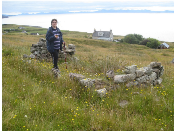
11 NG 74193 86863 69m ruined barn/byre with platform