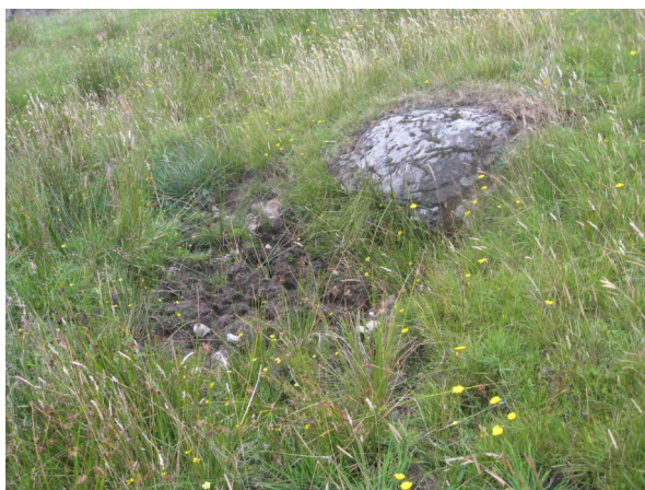
29 NG 74140 86536 36m ruin of phased house with cruck slots with two outbuildings and a stackyard ( see detailed survey)