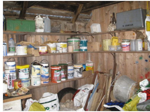
34 NG 74349 86437 39m footings of building down river embankment