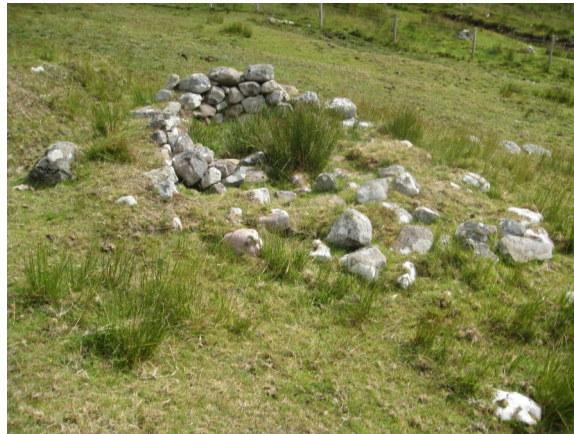
68 NG 74463 86588 70m corn drying kiln with barn