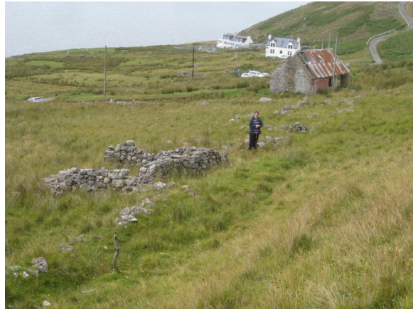
6 NG 74194 86944 78m enclosure attached to head dyke