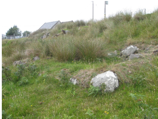
35 NG 74253 86391 41m footings of building down bank