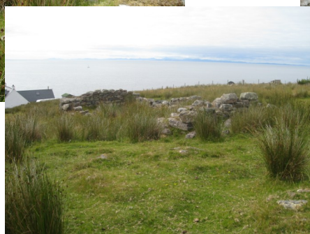
15 NG 74100 86890 57m ruined house with attached barn/byre