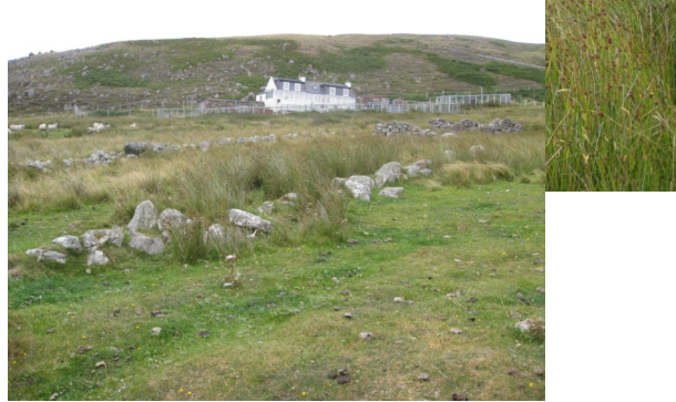
19 NG 73930 87042 40m stone bridge