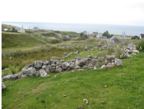
65 NG 74402 86486 57m ruined building partly reused as shed , otherwise filled with stone clearance