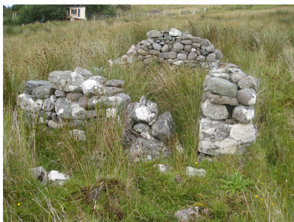
49 NG 74549 86532 79m older footings of house overlain by barn structure