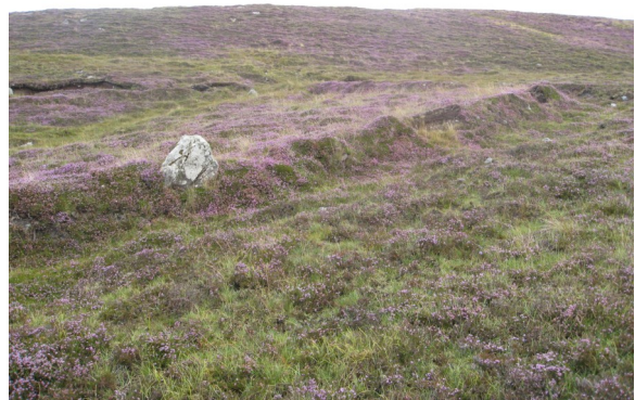
38 NG 74664 86685 117m enclosure