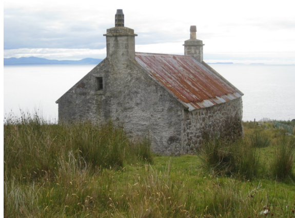
14 NG 74057 86810 47m ruined house and barn with footings indicating another building adjacent to these.