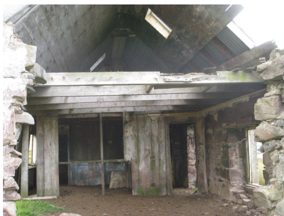
2 NG 74133 87048 74m footings of two compartment ruin, probably a byre dwelling