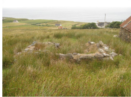
31 NG 74172 86738 59m building which was butchers shop