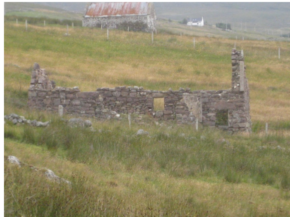
23 NG 73957 86752 34m ruined barn