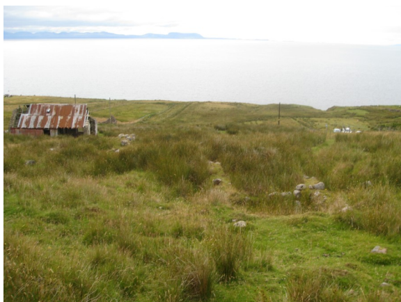
3 NG 74133 87055 73m footings of a three compartment building