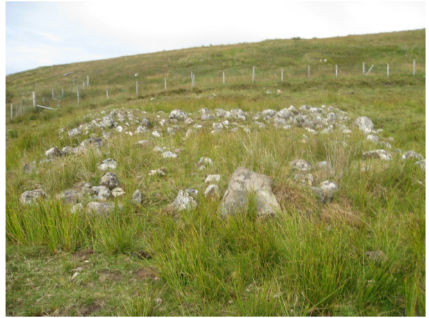
67 NG 74435 86602 71m ruin of small building