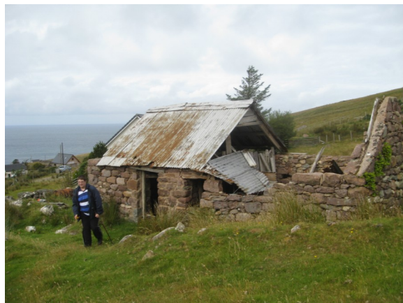
50 NG 74569 86516 78m stone footings of building overlain by concrete platform filled with stones