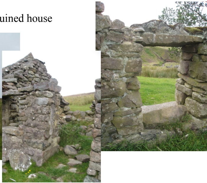
53 NG 74678 86531 94m footings of known barn/shed with rounded end wall