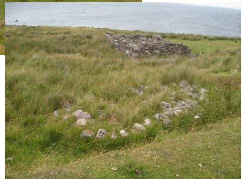
25 NG 73998 86683 31m ruined byre with byre drain