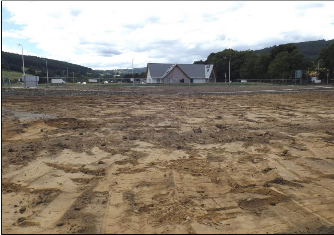
Plate 6 – View of centre of site upon stripping facing South-west (Photo 21).