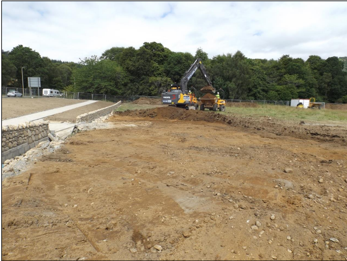
Plate 4 – View of work in progress facing North-west (Photo 14).