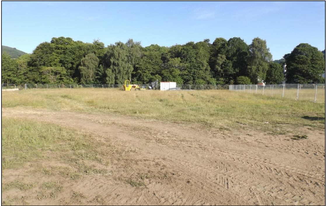
Plate 2 – View of site facing South-west (Photo 2).