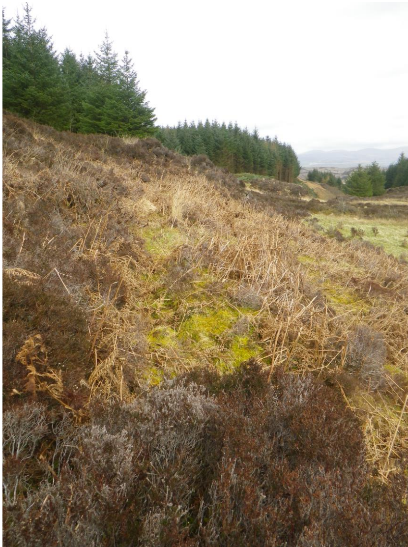
Fig. 2. Photograph of the bank, looking northeast.