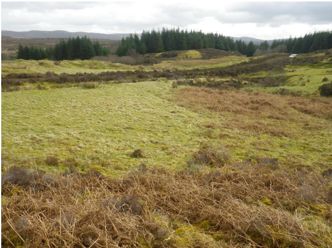
The development area