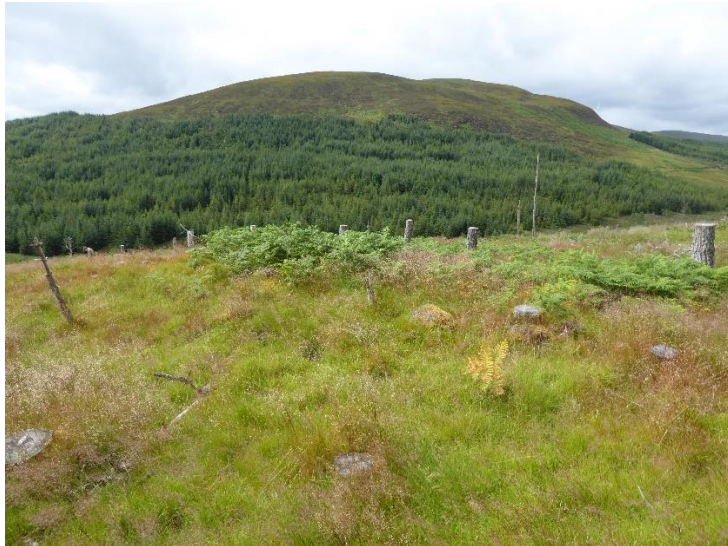
Figure 8 View of dyke looking SW