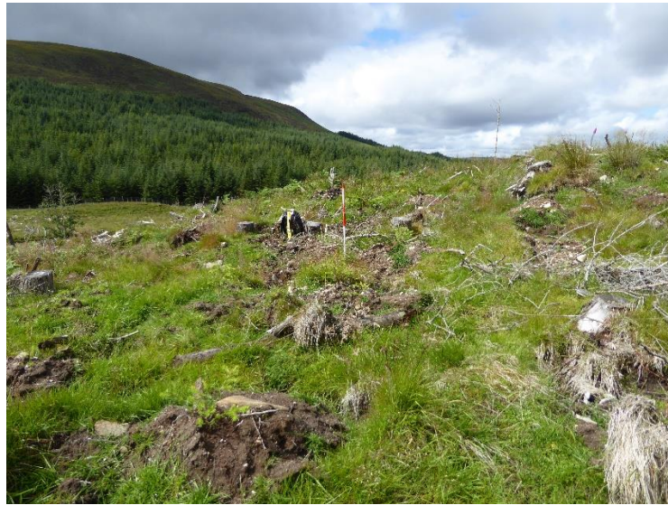
Figure 10 View of bloomery looking WNW

The site was marked by gps and taped around the area where spread of slag was visible. The site was photographed