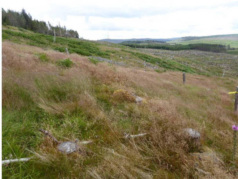
Figure 15 View of dyke beside Hut circles 3 and 4 looking