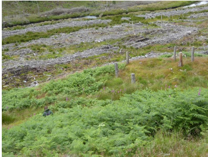
Figure 4 View of clearance cairn 2 looking S