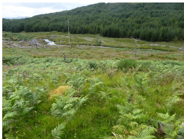
Figure 11 View of Hut circle 2 looking W

The hut circle 2 is c.8m across internally with walls c.2m across and c.0.75m high. The entrance was not clear but may lie in the SE arc. There is visible stone around the walls. The site was marked by gps and taped around the high stumps c.5m from the edge of the site. The site was photographed