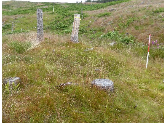
Figure 6 View of clearance cairn 4 looking NE

Site 6 Dyke NC 54884 04587, NC 54880 04590 NC 54870 04567, NC 54883 04563