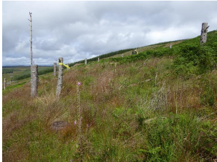
Figure 2 View of Hut circle 1 looking N

The clearance cairn 1 is c.8m across and c.1m high. The site was marked by gps and taped around the high stumps c.5m from the edge of the site. The site was photographed