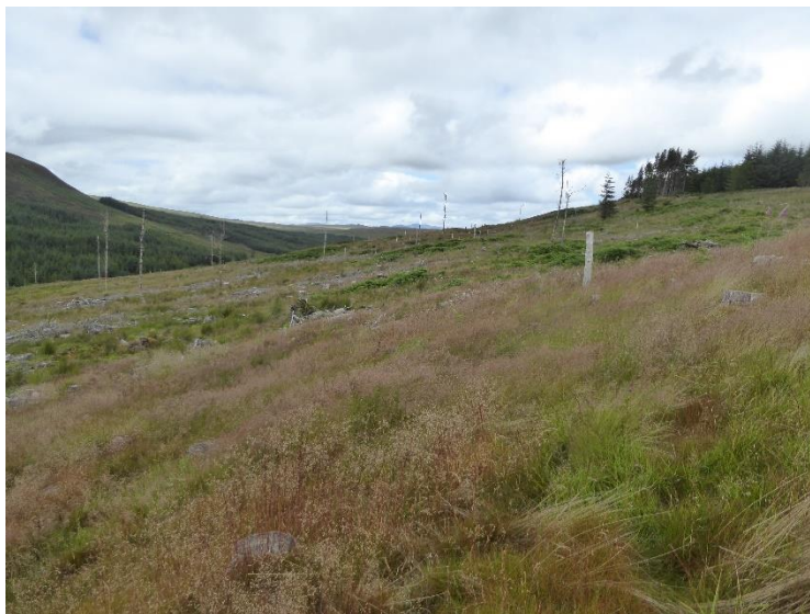
Figure 13 View of Hut circle 3 looking N

The hut circle 3 is c.10m across internally with walls c.1.5m wide and c.0.5m high. There is lots of visible stone in the walls and the entrance appears to be SE facing. Site 11 lies immediately to the SE of this hut circle giving the appearance of a double hut circle but there does seem to be a gap of c.4-5m between the walls. The site was marked by gps and taped around the high stumps c.5m from the edge of the site. The site was photographed