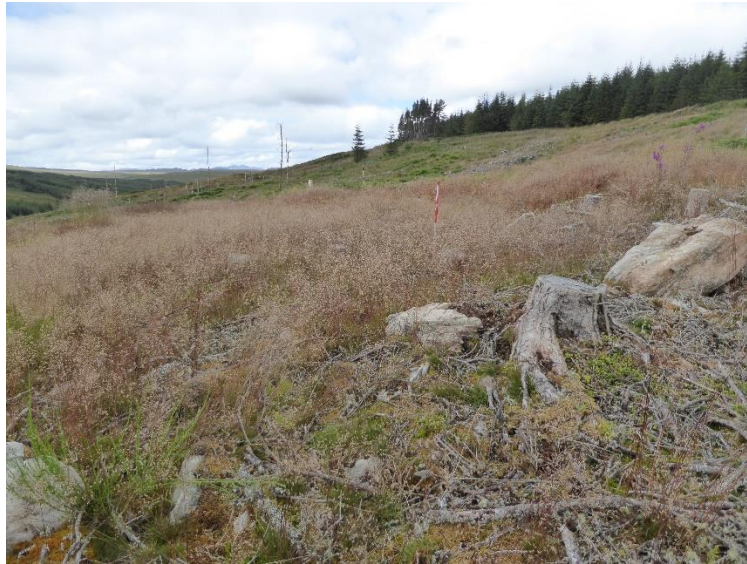
Figure 14 View of Hut circle 4 looking NW

The hut circle 4 is c.10m across internally with walls c.1.5m wide and c.0.5m high. There is lots of visible stone in the walls and the entrance appears to be SE facing. The site was marked by gps and taped around the high stumps c.5m from the edge of the site. The site was photographed