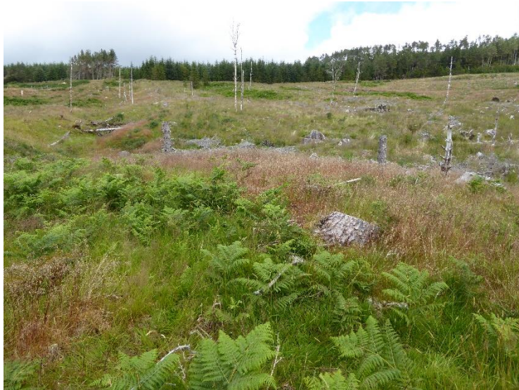
Figure 12 View of Hut circle 2 looking E

The hut circle 3 is c.10m across internally with walls c.1.5m wide and c.0.5m high. There is lots of visible stone in the walls and the entrance appears to be SE facing. Site 11 lies immediately to the SE of this hut circle giving the appearance of a double hut circle but there does seem to be a gap of c.4-5m between the walls. The site was marked by gps and taped around the high stumps c.5m from the edge of the site. The site was photographed