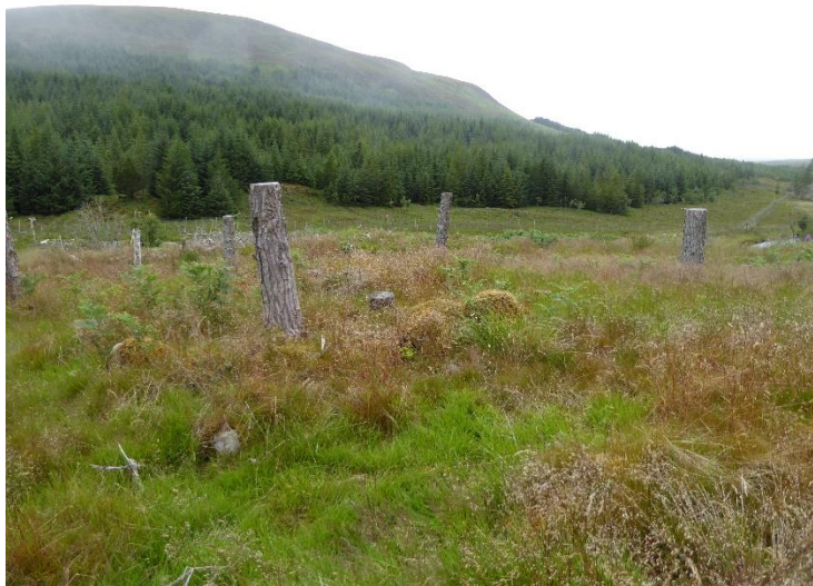
Figure 9 View of clearance cairn 5 looking E

The clearance cairn 5 is c.8m across and c.1m high with a slight hollow in the top. The site was marked by gps and taped around the high stumps c.5m from the edge of the site. The site was photographed