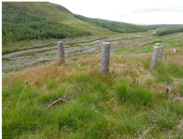
Figure 5 View of clearance cairn 3 looking N

The clearance cairn 3 is c.7m across and c.1m high with a deep hollow in the centre. The site was marked by gps and taped around the high stumps c.5m from the edge of the site. The site was photographed