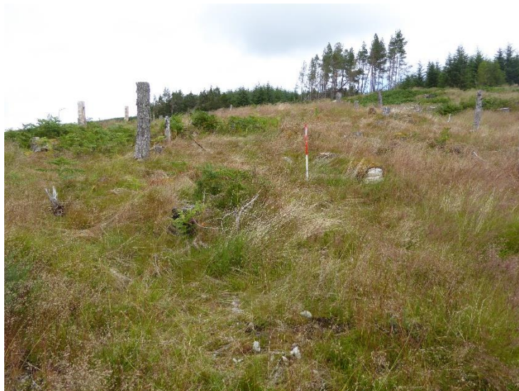
Figure 7 View of dyke looking NE

The stone and turf dyke appears to be part of a sub-rectangular enclosure but was not followed to its full extent. The dyke does not appear on any maps so it may have gone out of use by the time of the 1 st Edition OS map of 1843-82. The majority of the visible dyke was marked by gps and taped around the high stumps c.5m from the edge of the site. The site was photographed