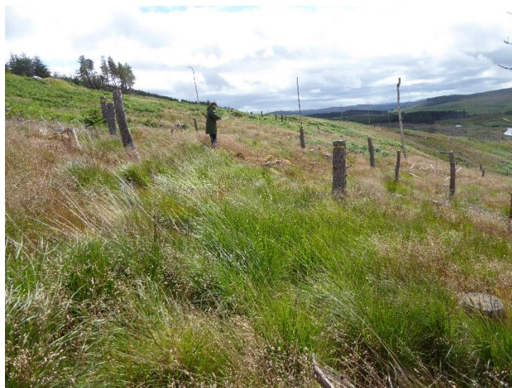
Figure 3 View of clearance cairn 1 looking S

The clearance cairn 1 is c.8m across and c.1m high. The site was marked by gps and taped around the high stumps c.5m from the edge of the site. The site was photographed