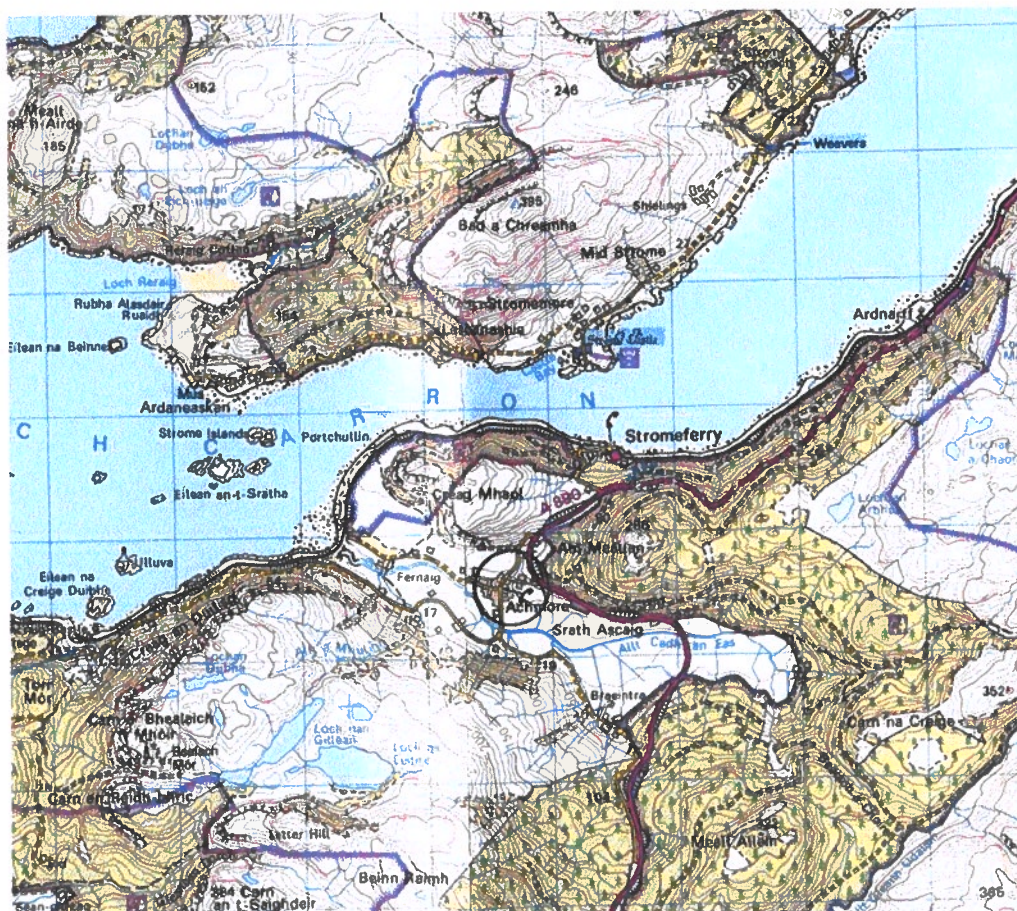
Figure 1: General Survey Location 1:50,000.