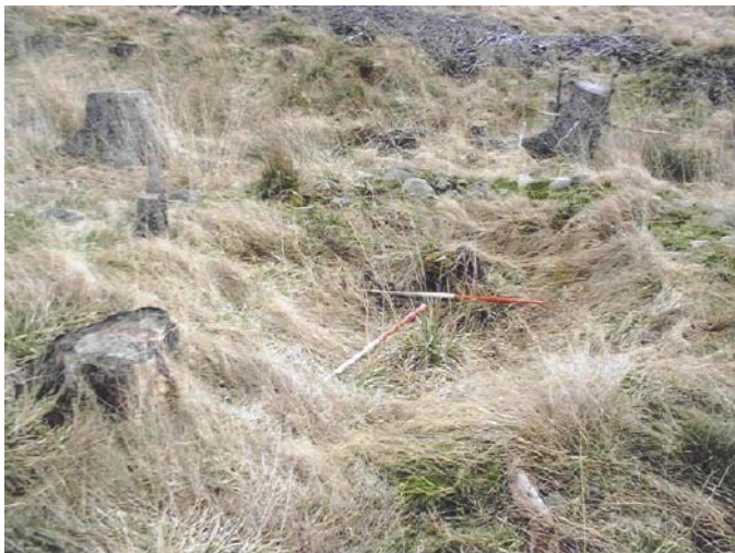
Structure beside burn - Scales 1m

Currently (March 2002) site is to have further work carried out in the form of an EDM survey.