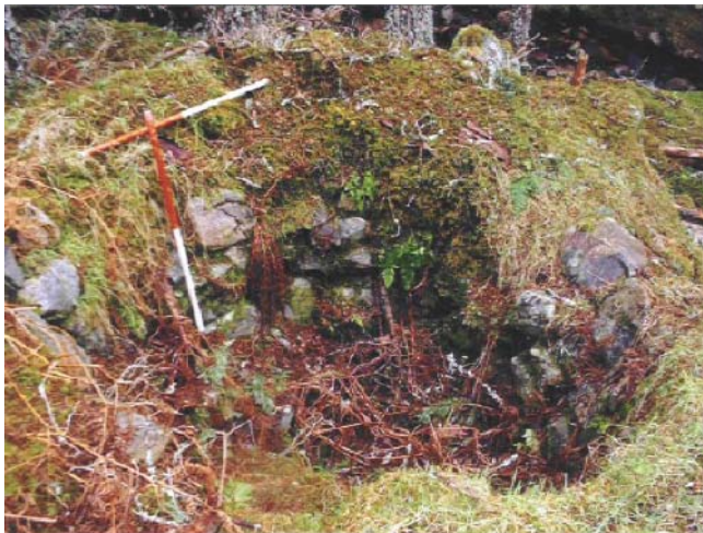
Bowl of kiln - scale 1m x 1m

Corn drying kiln likely to have been associated with Boichionnich Township. Measures 3m x 10m with kiln bowl 2.5m diameter and 1.5m deep includes barn to rear of 5m x 4.1m with walls 0.6m wide and 0.3m high.