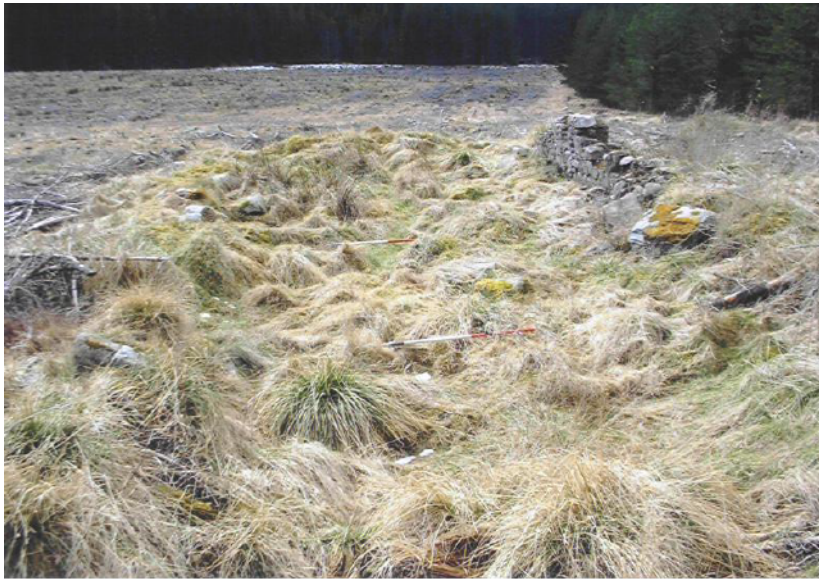
House of 1812 facing South - Scales 1m