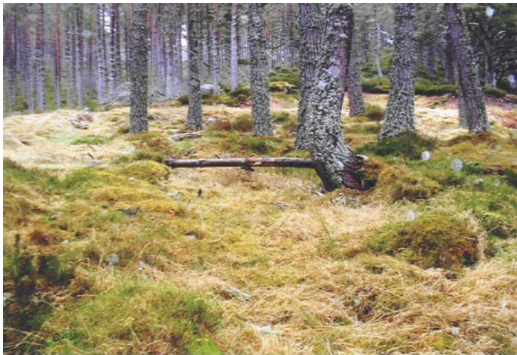
View of building

# - Complete site to be given 20m exclusion if any new planting to occur in this area, with site not to be felled by machine. Recommend that an EDM survey be conducted of area before felling. Possible site for future interpretation.