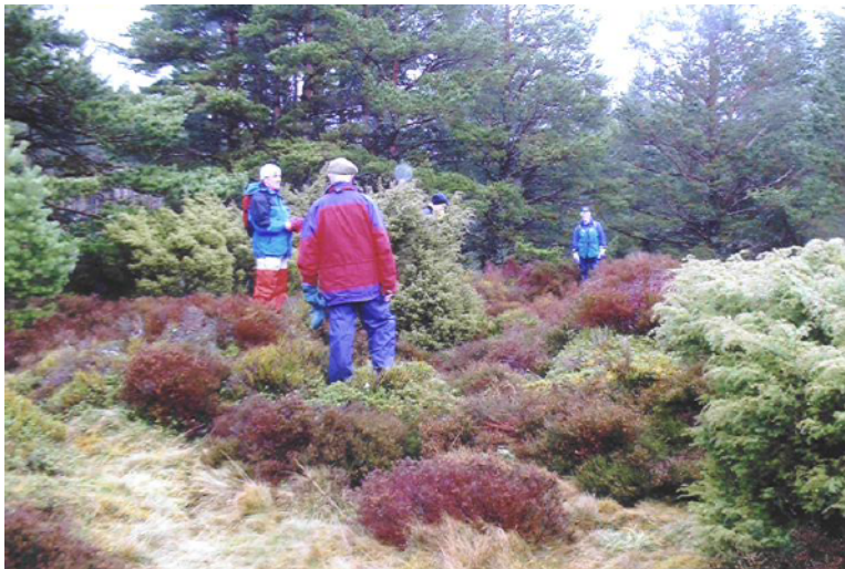
Volunteers standing at corners of building

Complete site to be given 20m exclusion if any new planting to occur in this area, site lies in open ground. Recommend that an EDM survey be conducted of area at a future date. Possible site for future interpretation as lies close to path.