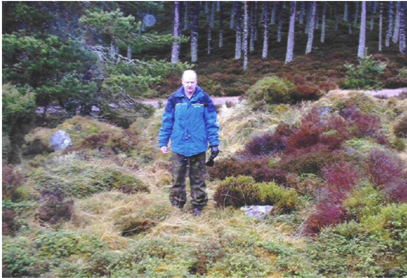
Volunteer standing in middle of shieling