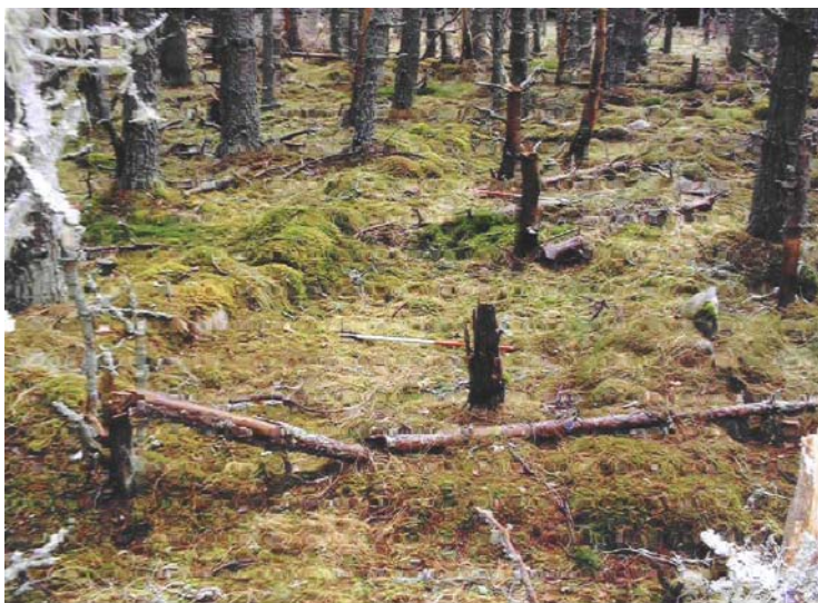
View of house - scales 1m