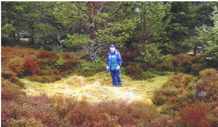
Volunteer standing in middle of pen