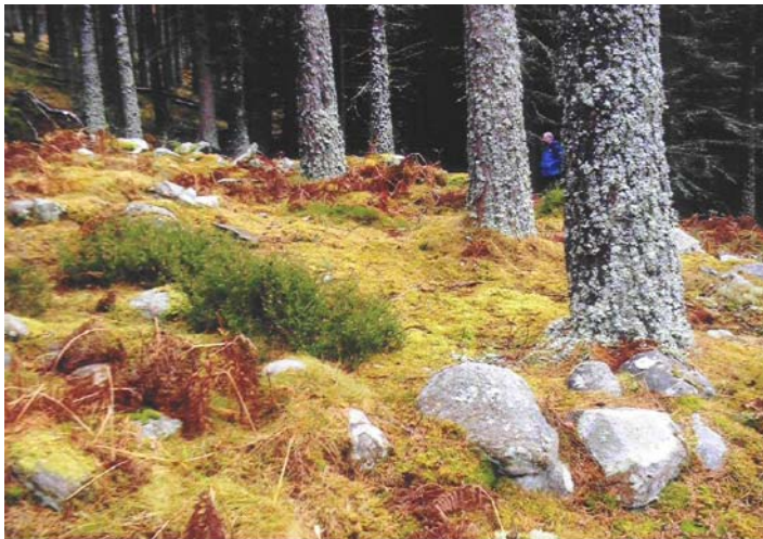
View of shieling facing East

# - Site to be given 20m exclusion if any new planting to occur in this area, with site not to be felled by machine.