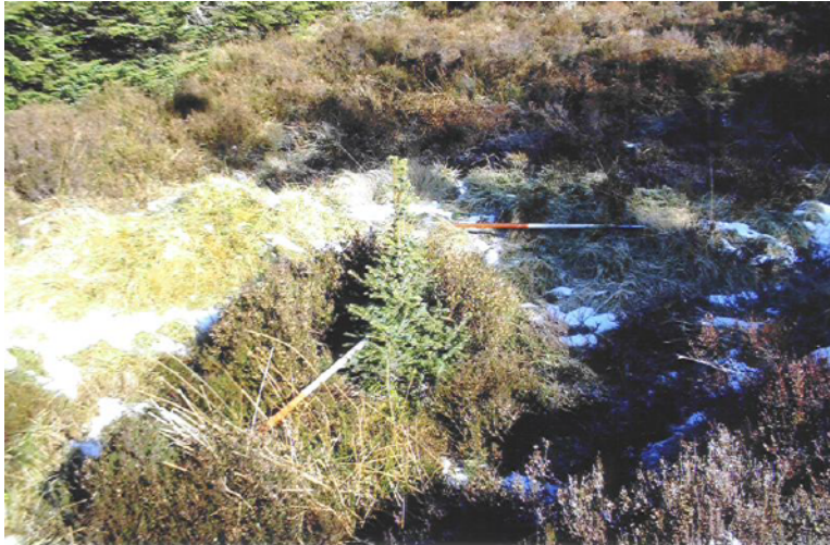
View of shieling - scales 1m

# - Site to be given 20m exclusion if any new planting to occur in this area, with site not to be felled by machine.