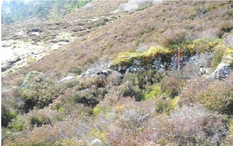
View of structure - Scales 1m

# Complete site to be given 20m exclusion if any new planting to occur in this area, site lies in open ground. Recommend that an EDM survey be conducted of area at a future date.