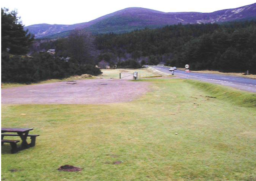
Site of enclosure facing north.

Enclosure marked on 1 st edition OS map now a car park. (See below) (Feb 2002)