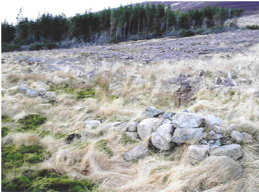
House site facing East