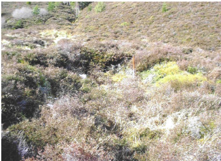
View of structure facing North - Scale 1m

# Complete site to be given 20m exclusion if any new planting to occur in this area.