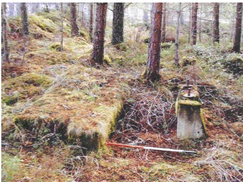
View of 2nd structures - Scale 1m