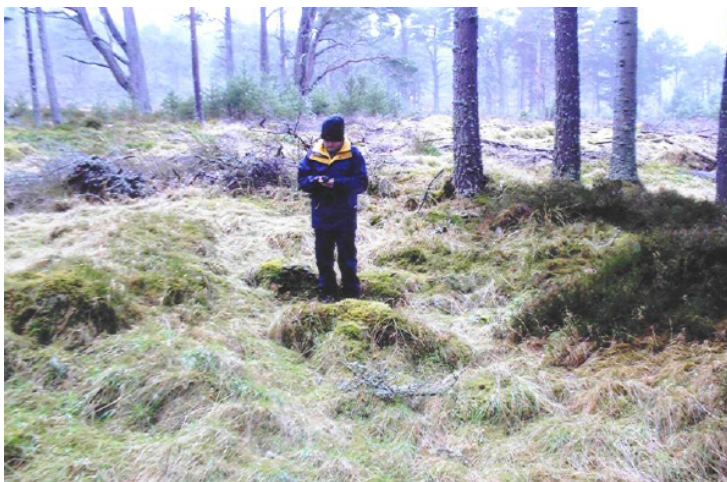
Volunteer standing in middle of 2nd building