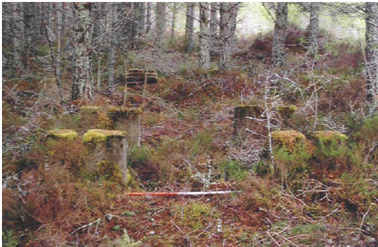
View of 1st structure - Scale 1m

# Complete site to be given 20m exclusion if any new planting to occur in this area, site lies in partly open ground. Recommend that an EDM survey be conducted of area at a future date.