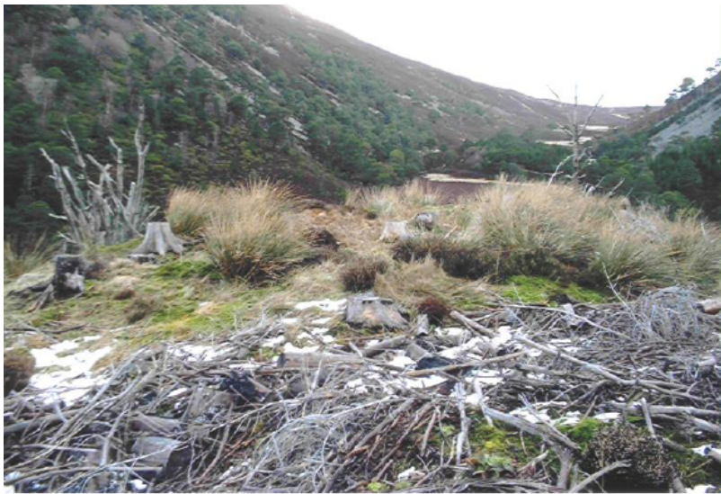
View of L shaped shielling facing East

# Complete site to be given 20m exclusion if any new planting to occur in this area. Recommend that an EDM survey be conducted of area at a future date.