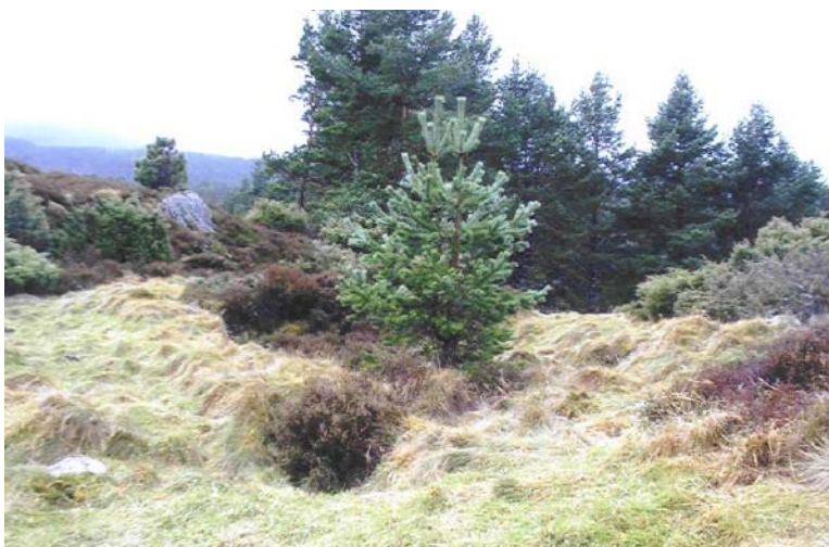
View of House