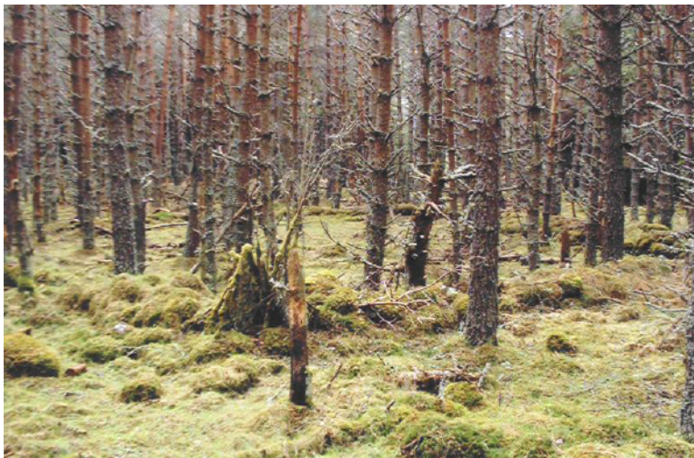
View of enclosure facing south

# - Complete site to be given 20m exclusion if any new planting to occur in this area, with site not to be felled by machine. Recommend that an EDM survey be conducted of area before felling. Possible site for future interpretation.