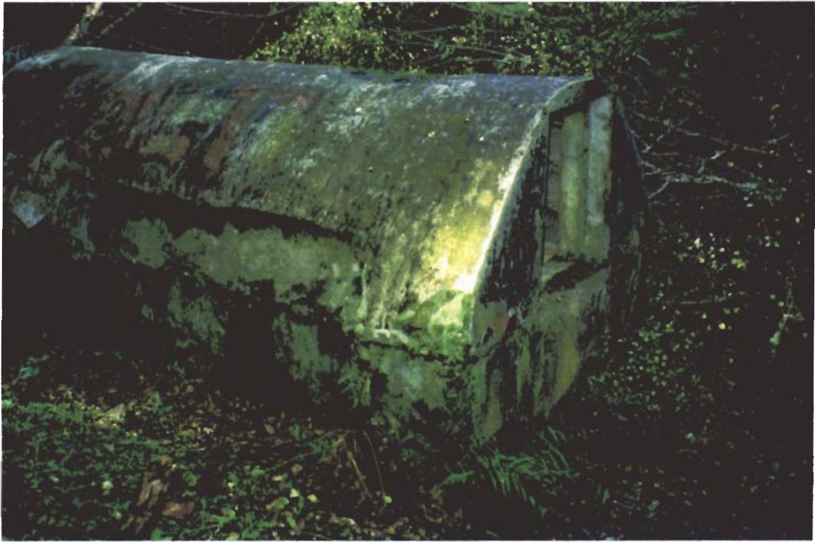
Figure 2 View of structure before development