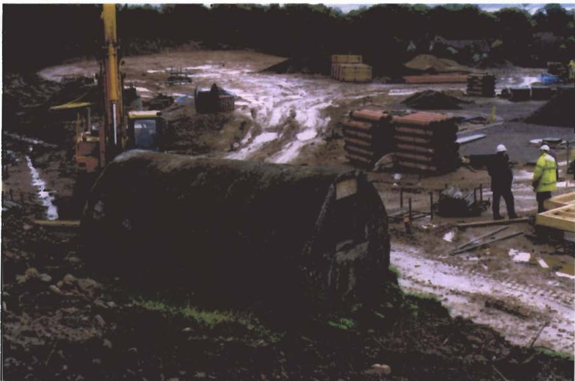
Figure 3 View of structure before immediately removal